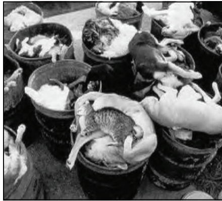
Discarded bodies tell the sad tale of unwanted animals in our nation. Haywood County Animal Services killed 1,445 dogs, puppies, cats and kittens in 2010 alone.

By joining forces with animal welfare organizations like HAWA, PetSmart plans to stop unwanted litters and reduce the high kill rate suffered in our nation's shelters. Last year, PetSmart challenged HAWA to