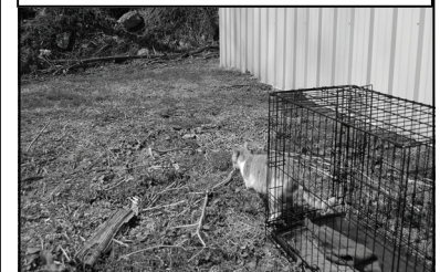
Home again after mandatory post-surgery confinement for in-heat cats