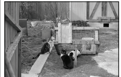
Drop trap safely captures last of trap-resistant cats in TNR colony